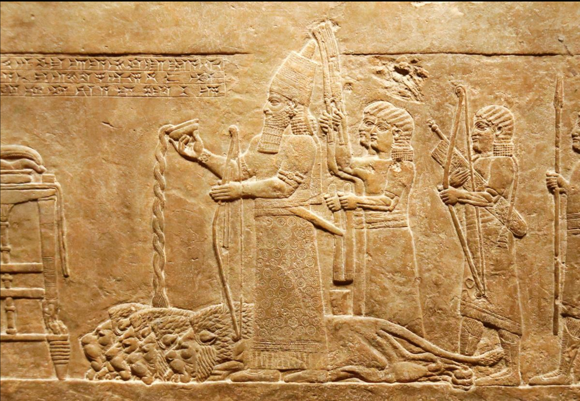
Relief of Ashurbanipal after a royal lion hunt, from Nineveh, circa 640 BC