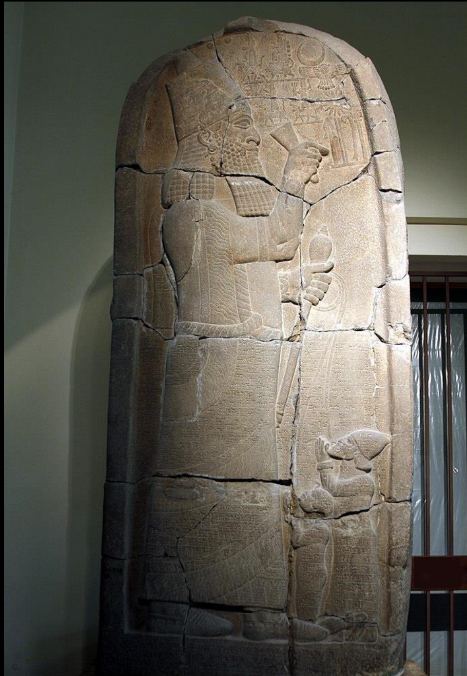
Stele of Esarhaddon with captive kings, 671 BC